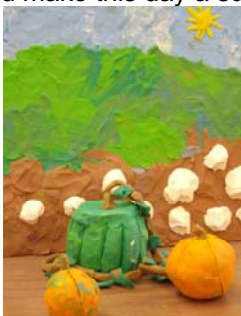
The Little Green Pumpkin

James, Jared, and Jessie helped the grades 1 & 3 students from F.W. Gilbert get into the Halloween spirit by sharing a book they created. They began by showing the students their pumpkin patch in the courtyard of PSS. Heritage seeds from a trip to Fort Whyte last spring had been planted in the garden and yielded one green pumpkin. The students were then brought inside where Jessie, Jared, and James shared pumpkin facts. These students had created a story around the green pumpkin and illustrated it with plasticine backdrops and characters. Snapshots of each scene were taken, and then downloaded into PowerPoint. Next, the text of the story was superimposed over the pictures. The end product projected on the SMARTBOARD looked like a professional children's book. After the story was read, the response from the audience indicated that the book was a hit. This project was a collaborative project between Art, Social Studies, and Resource. Thanks to all who helped make this day a success.